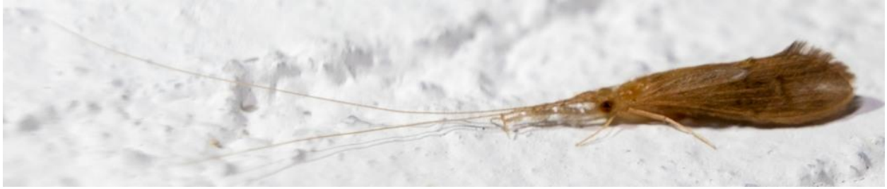
Caddisflies (family Leptoceridae)