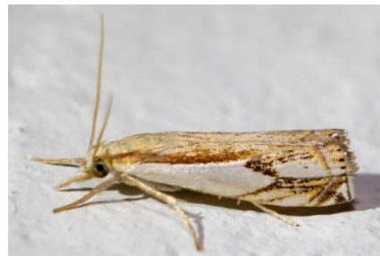
Double-banded Grass-veener ( Crambus agitatellus )