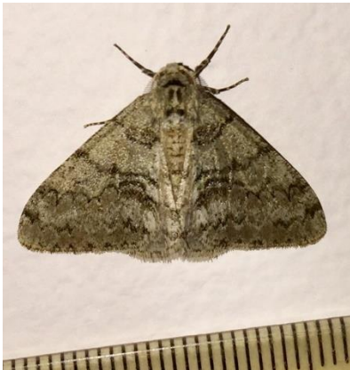
Toothed Phigalia ( Phigalia denticulata )