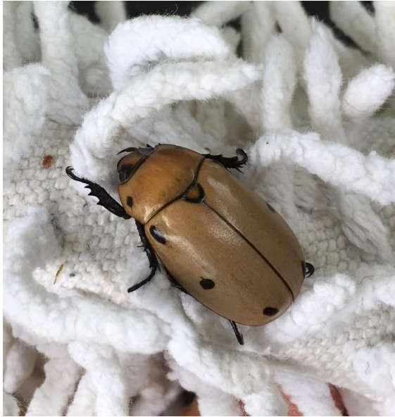
Beetles (family Coleoptera)