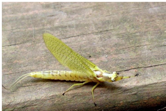
Mayflies (order Ephemeroptera)