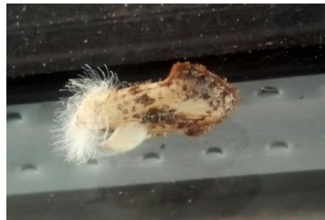
Frilly Grass Tubeworm Moth ( Acrolophus mycetophagus )