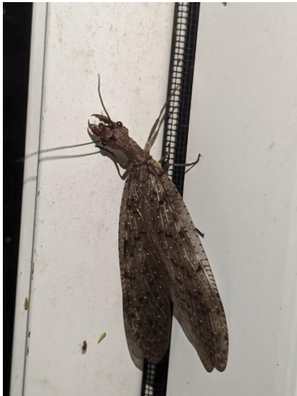
Dobsonfly (family Corydalidae)