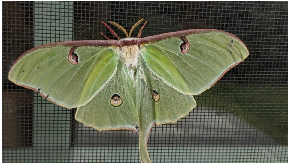
Luna moth ( Actias luna )

Here is a sampling of what you might see at your light!