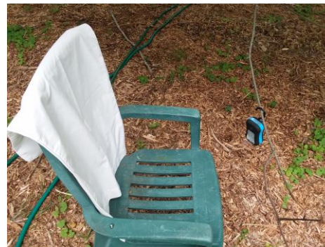
A white towel hanging over a chair