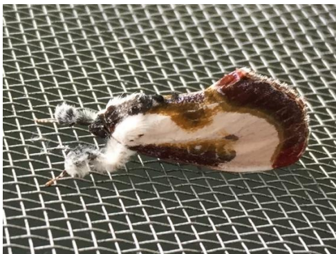
Beautiful Wood-nymph ( Eudryas grata )