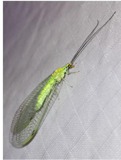
Lacewings (family Chrysopidae)