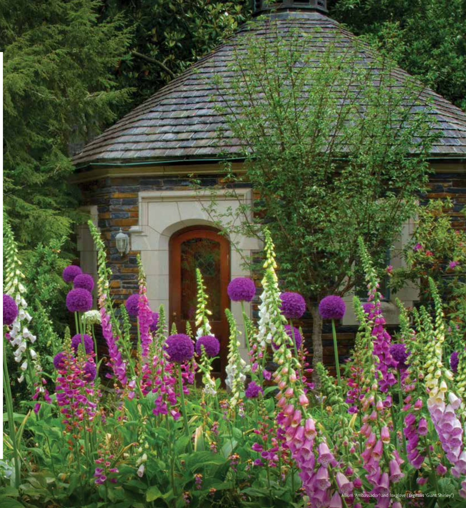
Allium 'Ambassador' and foxglove ( Digitalis 'Giant Shirley')