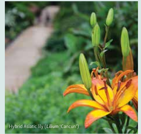
Hybrid Asiatic lily ( Lilium 'Cancun')