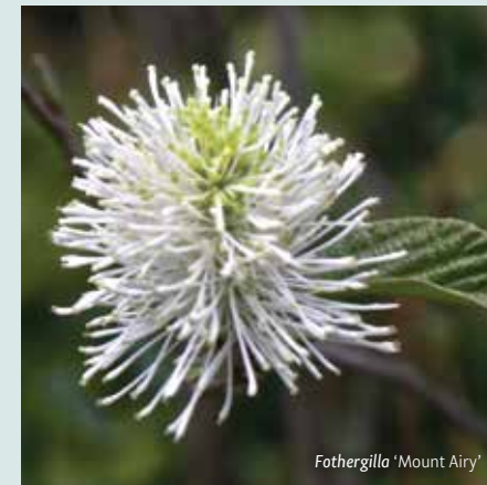
Fothergilla 'Mount Airy'