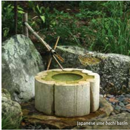
Japanese ume bachi basin

Be recognized as one of the best public gardens in America.