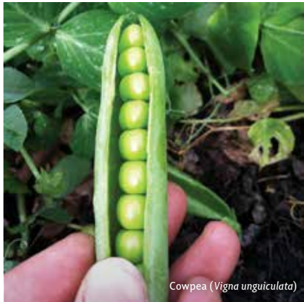
Cowpea ( Vigna unguiculata )