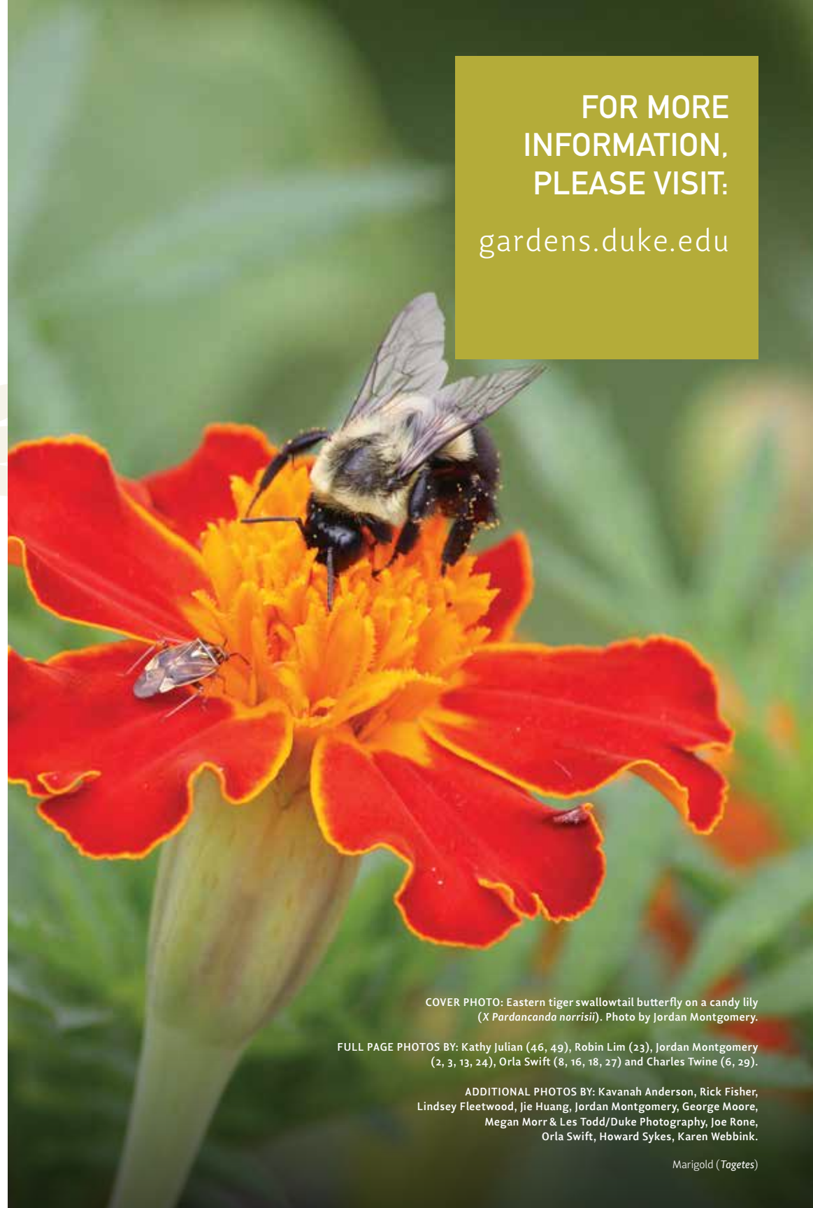
COVER PHOTO: Eastern tiger swallowtail butterfly on a candy lily ( X Pardancanda norrisii ).

FOR MORE INFORMATION, PLEASE VISIT: gardens.duke.edu