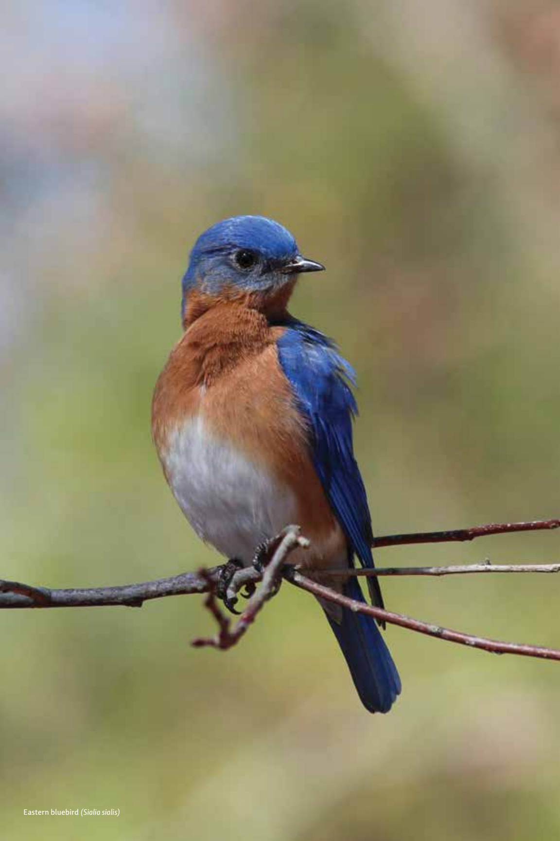
Eastern bluebird ( Sialia sialis )