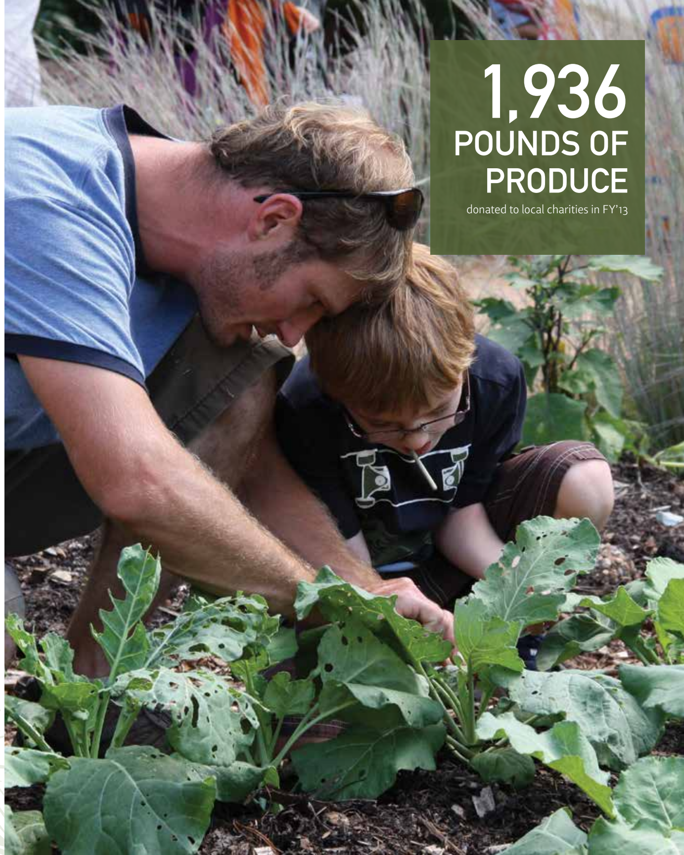
RIGHT: Families learn more about plants together in the Charlotte Brody Discovery Garden. PAGE 29: Charlotte Brody Discovery Garden