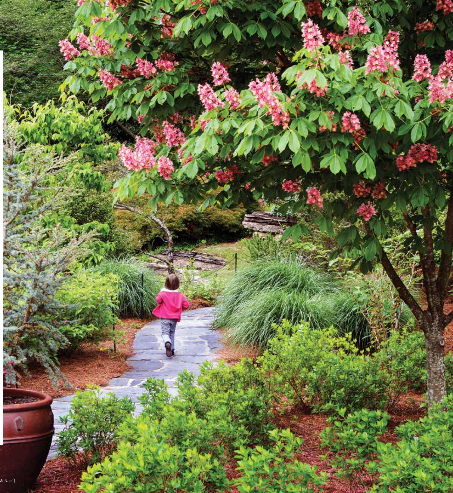
Horse chestnut ( Aesculus 'Fort McNair')