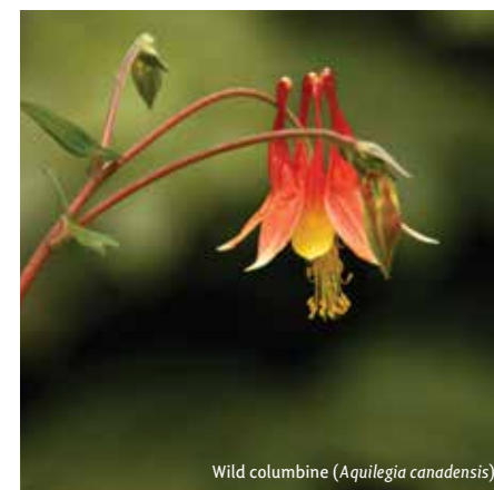
Wild columbine ( Aquilegia canadensis )

Develop resources and manage operations for long-term financial strength.