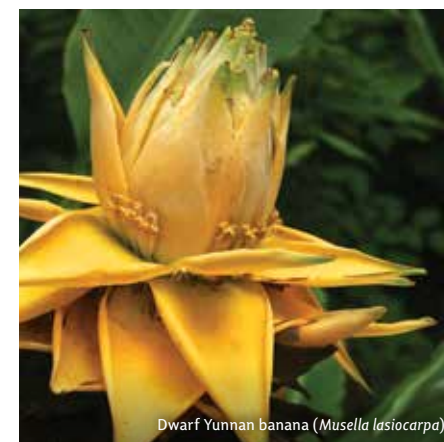
Dwarf Yunnan banana ( Musella lasiocarpa )