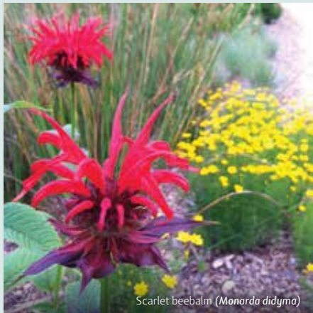
Scarlet beebalm ( Monarda didyma )